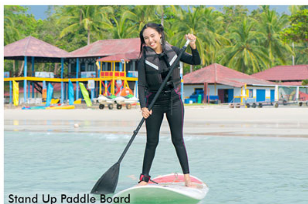
Stand Up Paddle Board