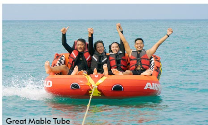
Great Mable Tube