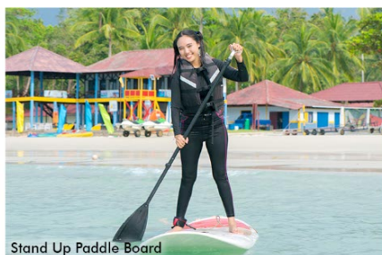
Stand Up Paddle Board