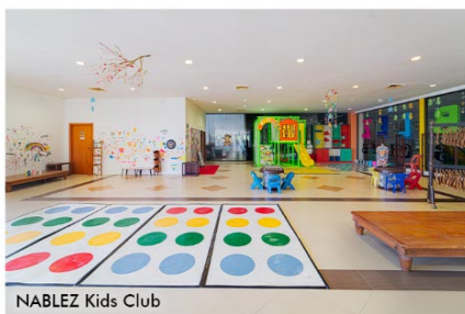
NABLEZ Kids Club

Last booking closes at 4pm daily for all recreation and water sports activities, unless otherwise stated. All prices are subject to prevailing government tax (11%) and service charge (10%) except for activities marked with (*) are with no service charge. Prices listed are presented in thousand rupiah ('000'). For more information or booking, get in touch with our Guest Information Centre.